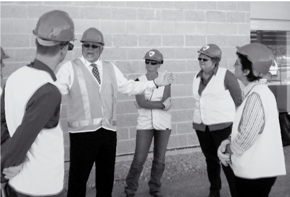
Ombudsman office staff visiting the Alexander Maconochie Centre site