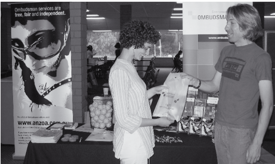
Outreach at the University of Canberra with other members of the Australian and New Zealand Ombudsman Association

Under the new legislative regime, responsibility for investigating complaints rests with the AFP. The new model removes the requirement for joint handling of all complaints. AFP line managers are now required to deal with minor matters. More serious matters are notified to the